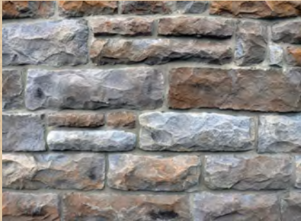
Dakota Cut Stone