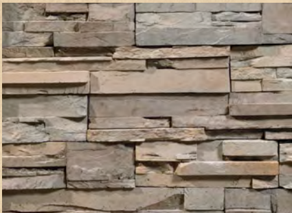
Pheasant ProStack Lite