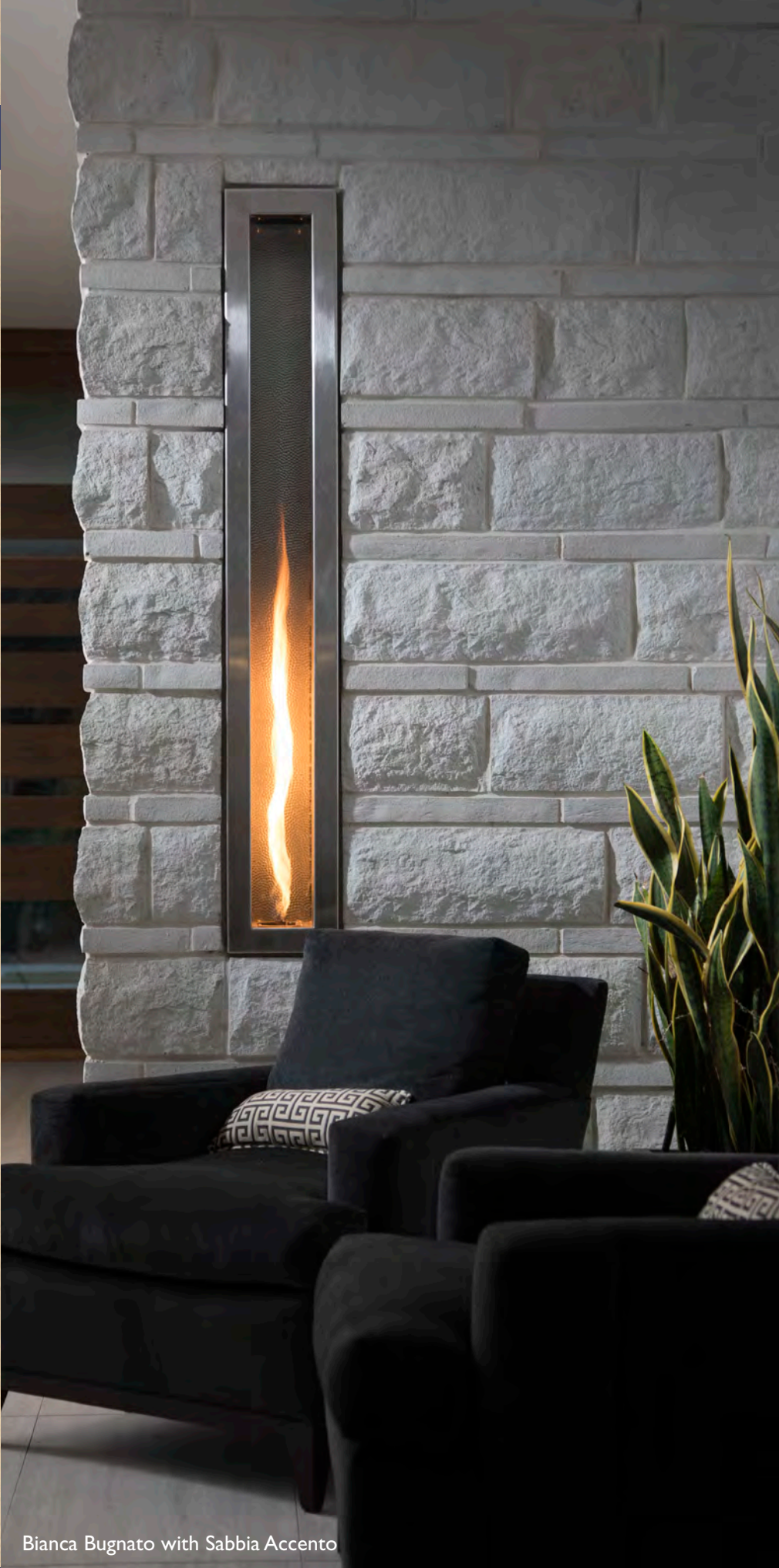
Bianca Bugnato with Sabbia Accento