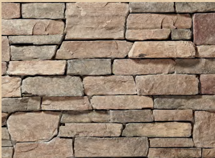
Bucks County Southern LedgeStone