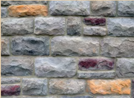
Manor Cut Stone