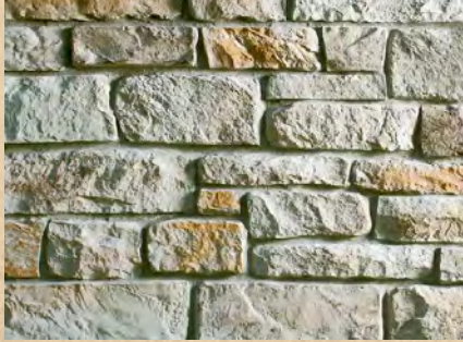
Tundra Cut Stone