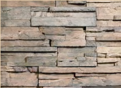
Bucks County ProStack Lite