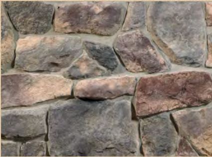
New England Fieldstone