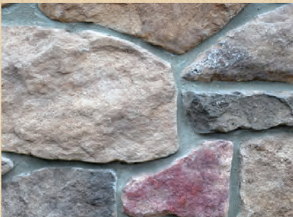
Bucks County Rubble Fieldstone