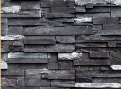
Black Rundle ProStack Lite