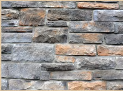
Kentucky Cobble LedgeStone