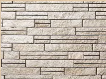
Cream Prairie Stone