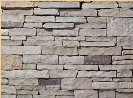
PA Sierra LedgeStone