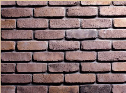
Aspen Tumbled Brick