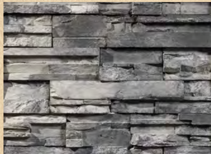
Nantucket ProStack Lite