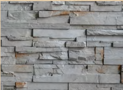
Platinum ProStack Lite