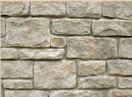
Carolina Cut Stone