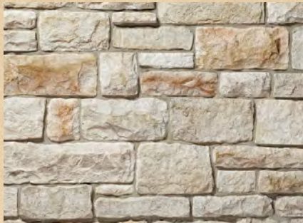
Atglen Cut Stone