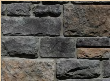
Bull Run Cut Stone