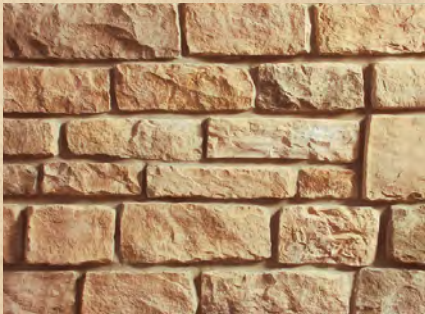
Buff Cut Stone