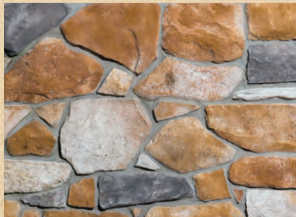
Valley Brook Fieldstone