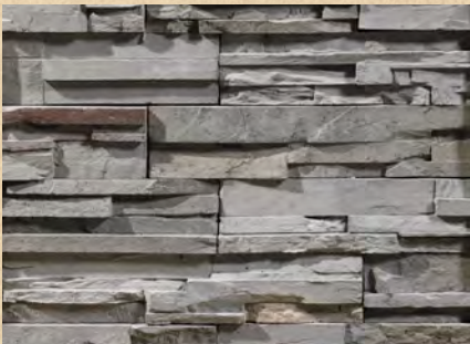
Manor ProStack Lite