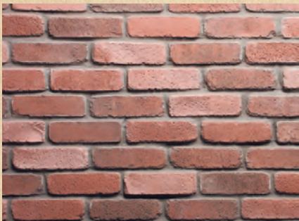
Benson Tumbled Brick