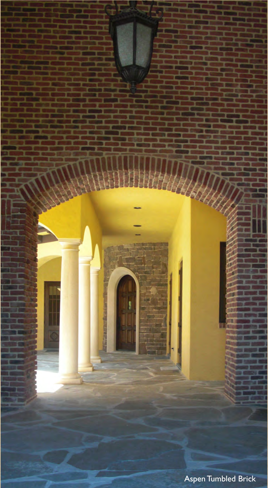
Aspen Tumbled Brick