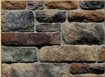
Provence Cut Stone