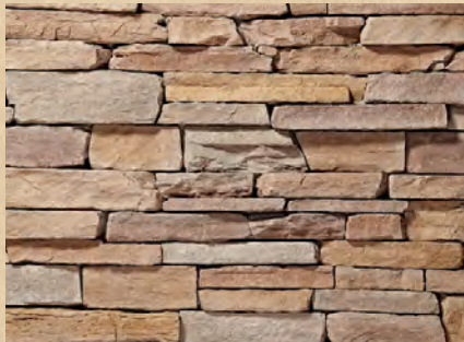
Autumn Southern LedgeStone