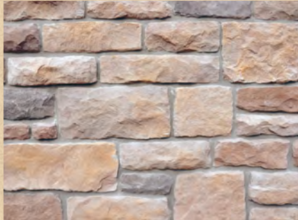
Aspen Cut Stone