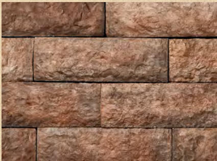
Desert Sunset Luxor