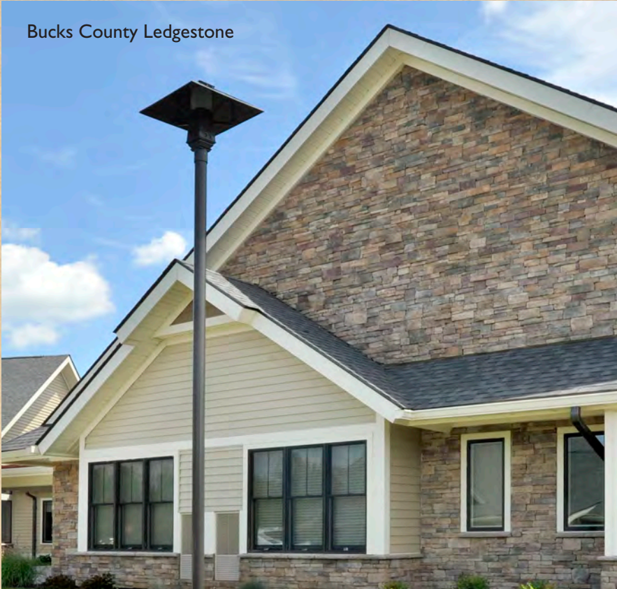
Bucks County LedgeStone