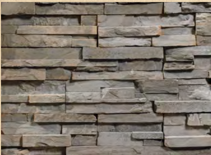
Dakota ProStack Lite