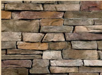
Buckeye Southern LedgeStone