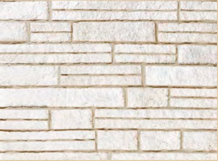
Osceola Prairie Stone