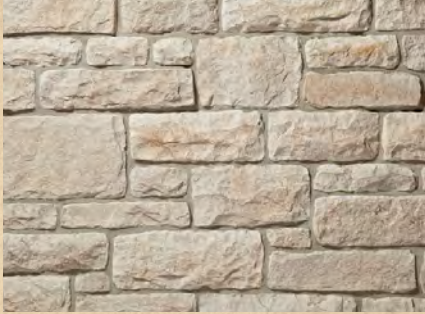
Texas Cut Stone