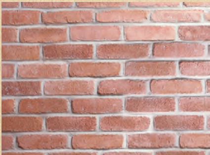
Harvest Tumbled Brick