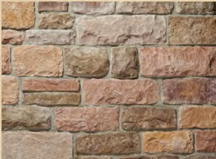
Autumn/Buckeye (50%/50%) Cut Stone