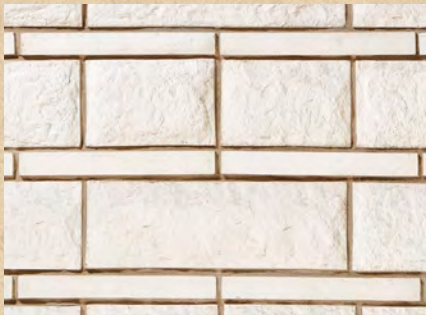
Cream Bugnato with Legna Accento