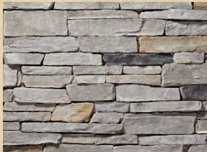
PA Sierra Southern LedgeStone