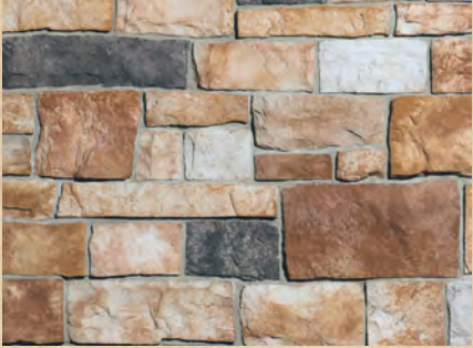
Valley Brook Cut Stone