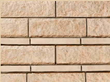
Taupe Luxor with Sabbia Accento