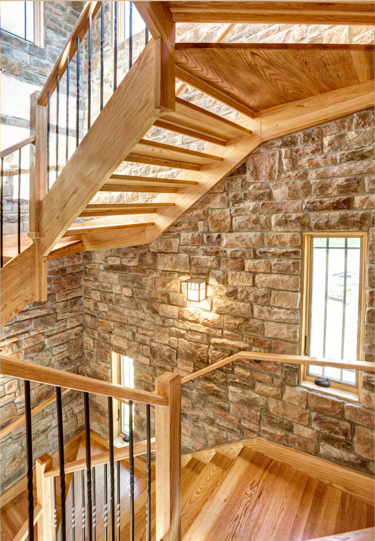
Autumn/Buckeye (50%/50%) Cut Stone