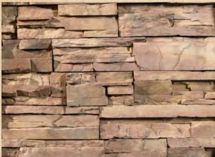
Cypress ProStack Lite