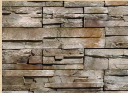
Buckeye ProStack Lite