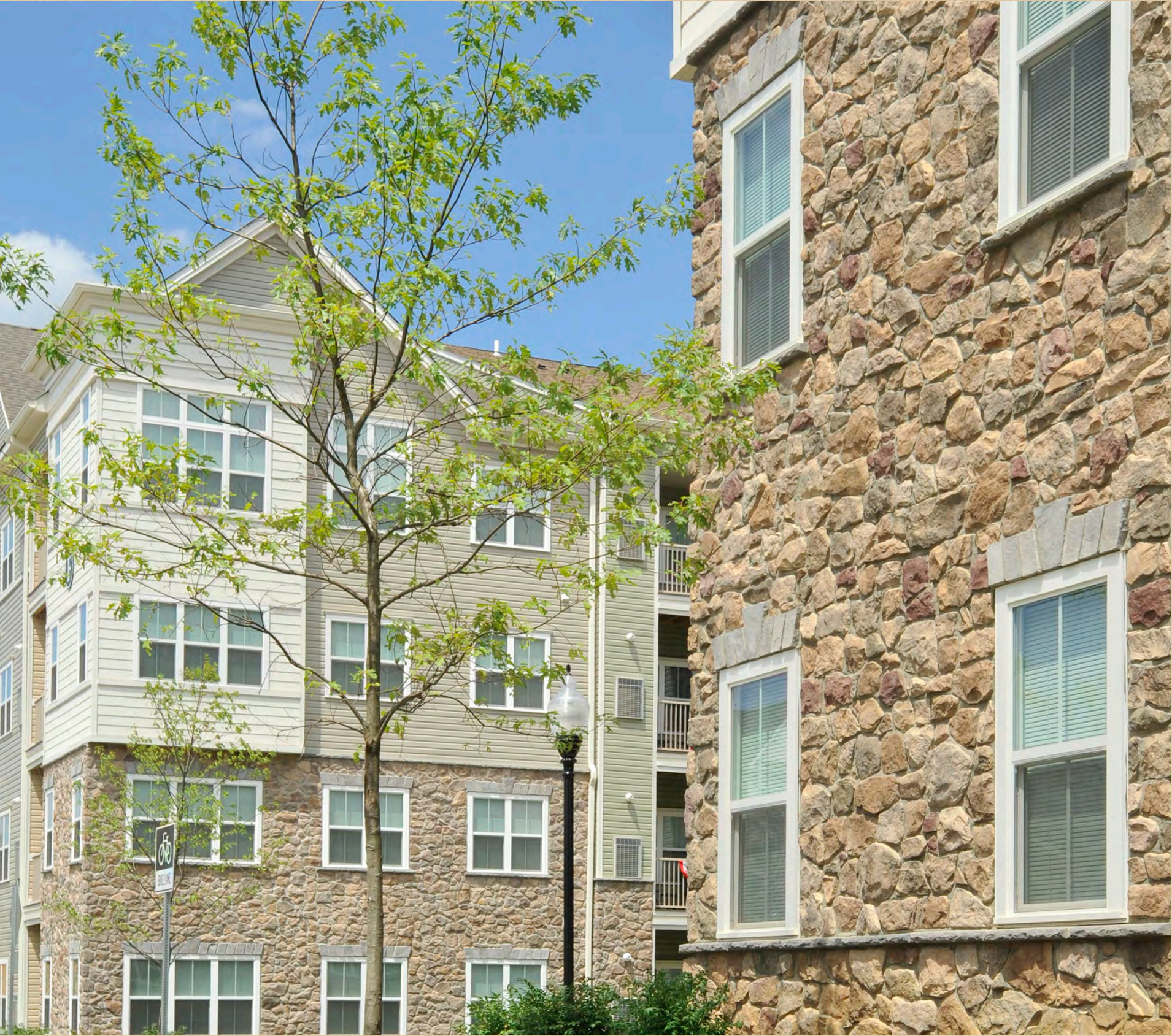
Autumn/Buckeye (50%/50%) Fieldstone