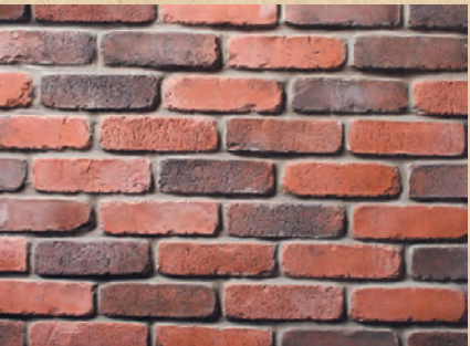
Charleston Tumbled Brick