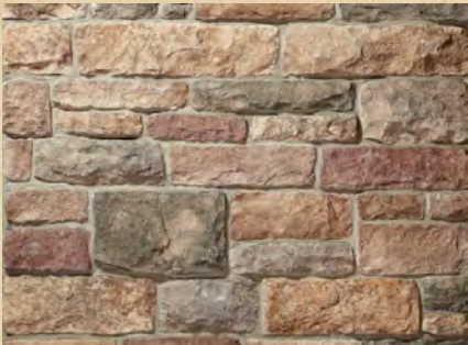
Bucks County Cut Stone NE