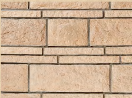
Taupe Bugnato with Roccia Accento