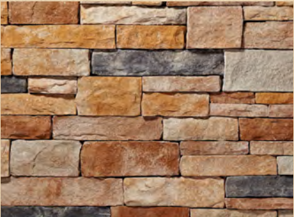
Valley Brook LedgeStone