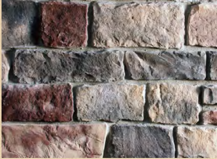
New England Cut Stone