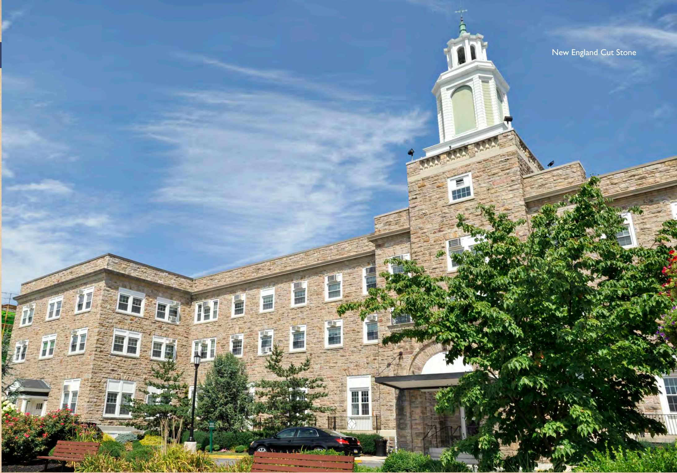
New England Cut Stone