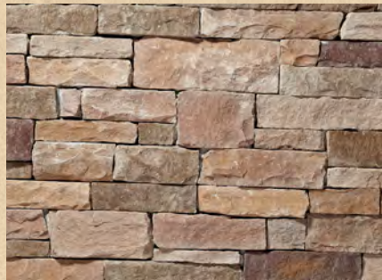
Autumn/Buckeye (50%/50%) LedgeStone