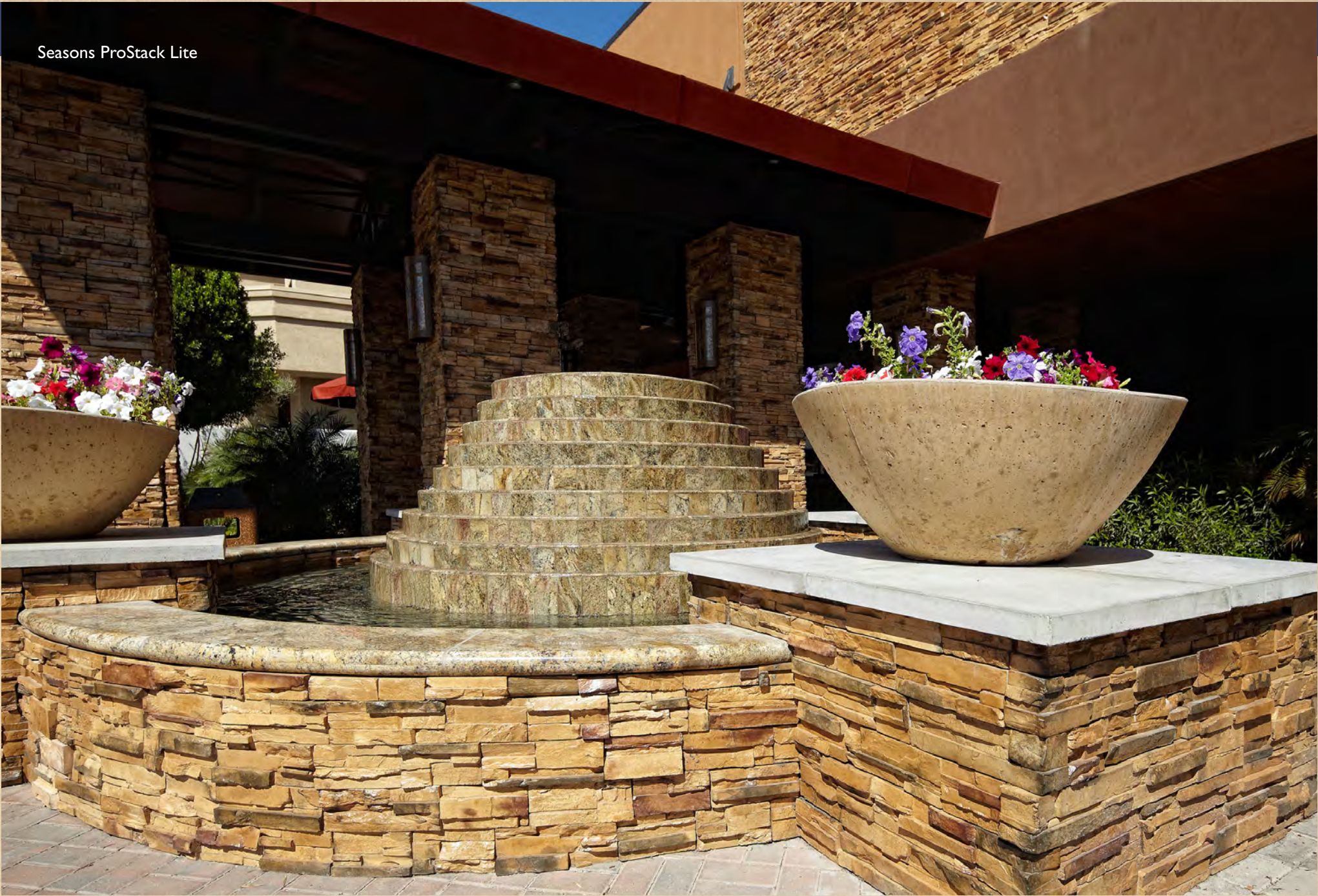
Seasons ProStack Lite