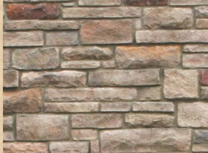
Pennsylvania Cobble LedgeStone