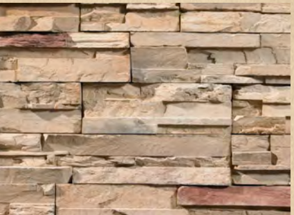
Seasons ProStack Lite