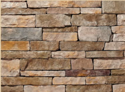
Aspen/Buckeye (50%/50%) LedgeStone