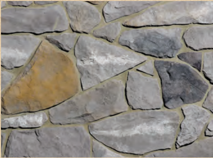
PA Sierra Fieldstone