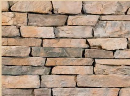
Aspen Southern LedgeStone