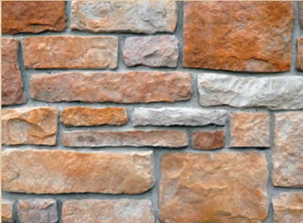
Laurel Creek Cut Stone