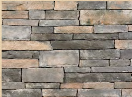
Bull Run LedgeStone