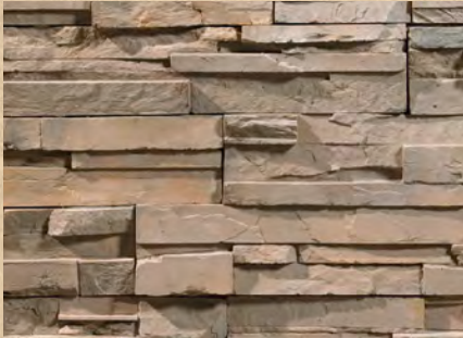
Aspen ProStack Lite