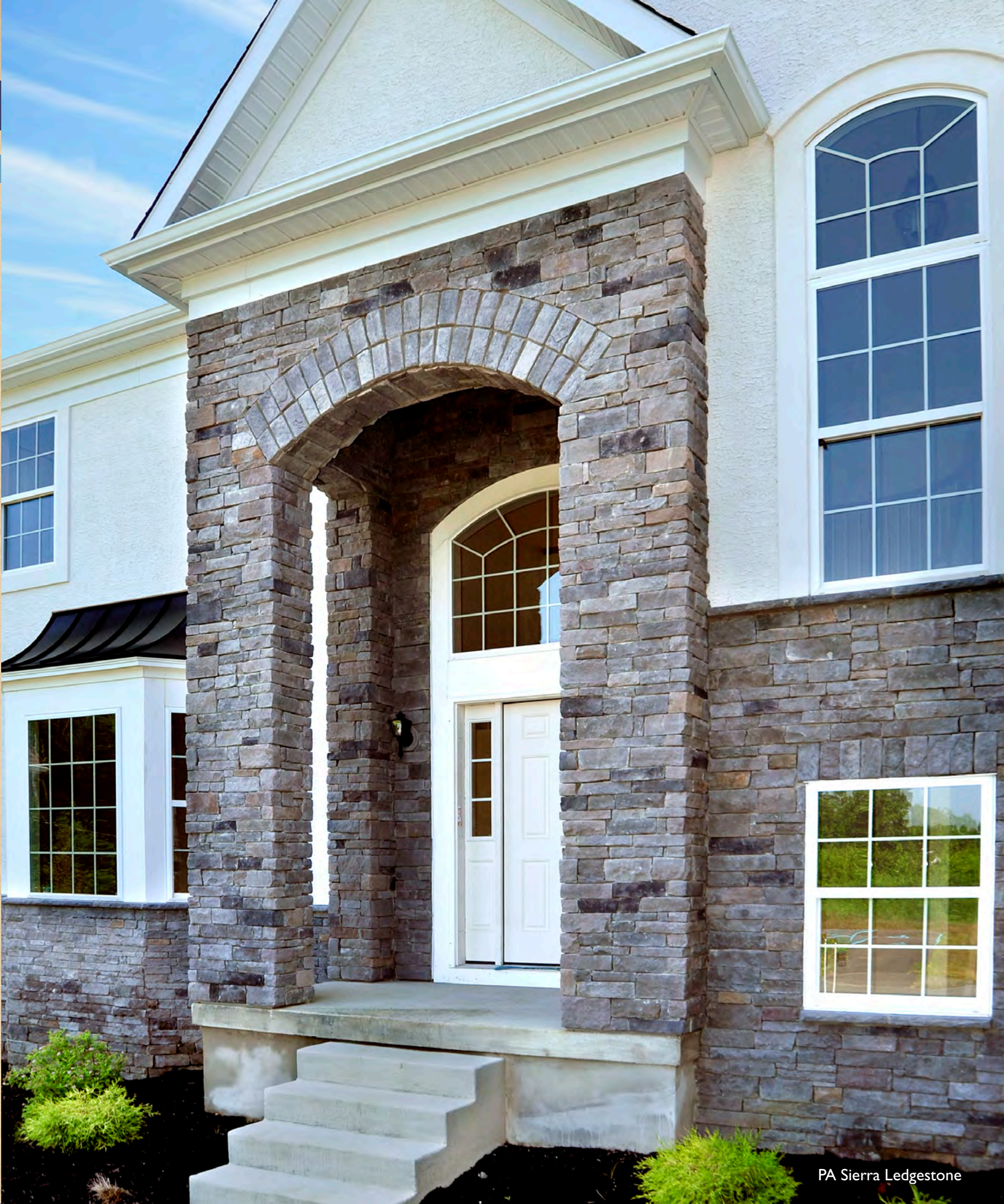
PA Sierra LedgeStone