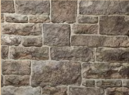
Appalachian Cut Stone