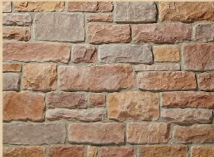
Autumn Cut Stone