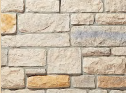
Ohio Blue Vein Cut Stone