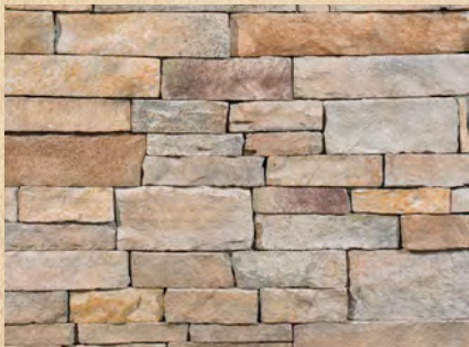
New Hampshire LedgeStone