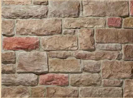
Pennsylvania Cut Stone