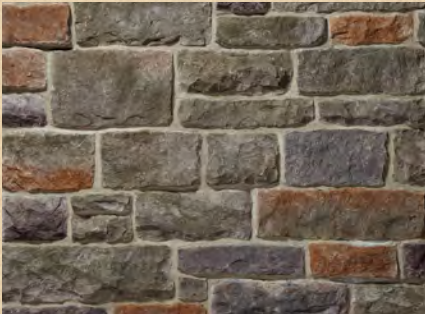
San Francisco Cut Stone