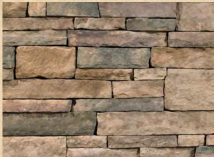
Bucks County LedgeStone