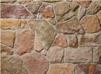
Autumn/Buckeye (50%/50%) Fieldstone