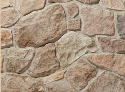
Aspen/Buckeye (50%/50%) Fieldstone