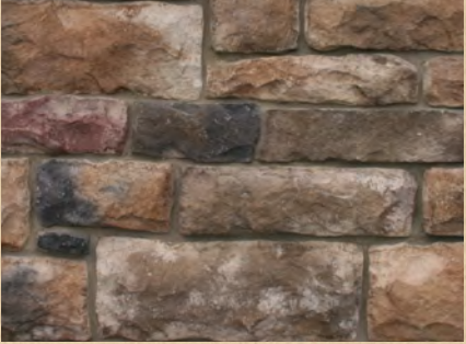
Washington Cut Stone