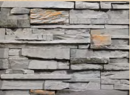
Salmon ProStack Lite