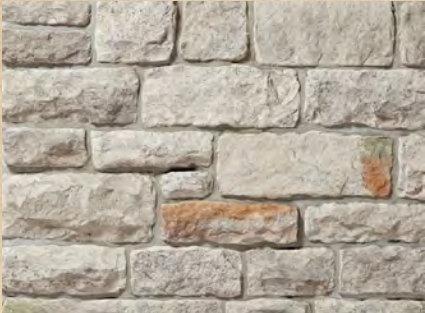
Ashton Cut Stone