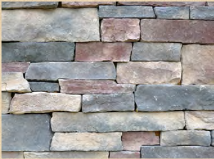
New England LedgeStone