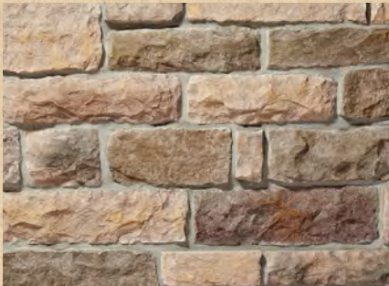
Aspen/Buckeye (50%/50%) Cut Stone