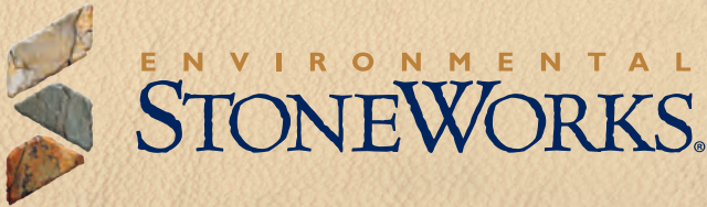
Conestoga Southern LedgeStone

This Warranty covers only manufacturing defects in Environmental StoneWorks' products. It does not cover damage resulting from building settlement, wall movement, contact with chemicals, efflorescence, stain or paint, discoloration due to airborne contaminants, staining or oxidation. The Toughest Stone Out There! To review the warranty in whole visit stoneworks.com resource section.