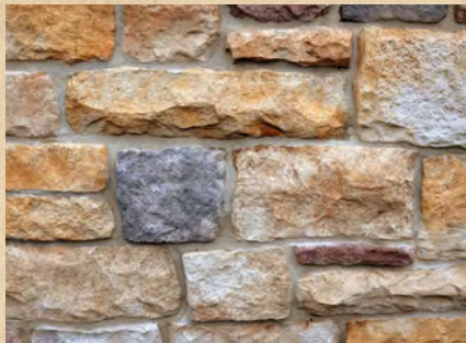
Champagne Cut Stone